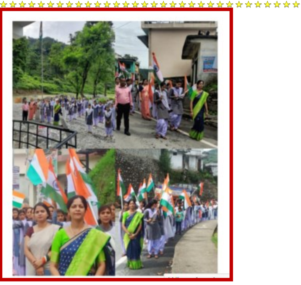
Rally Under Ek Bharat Shreshth Bharat