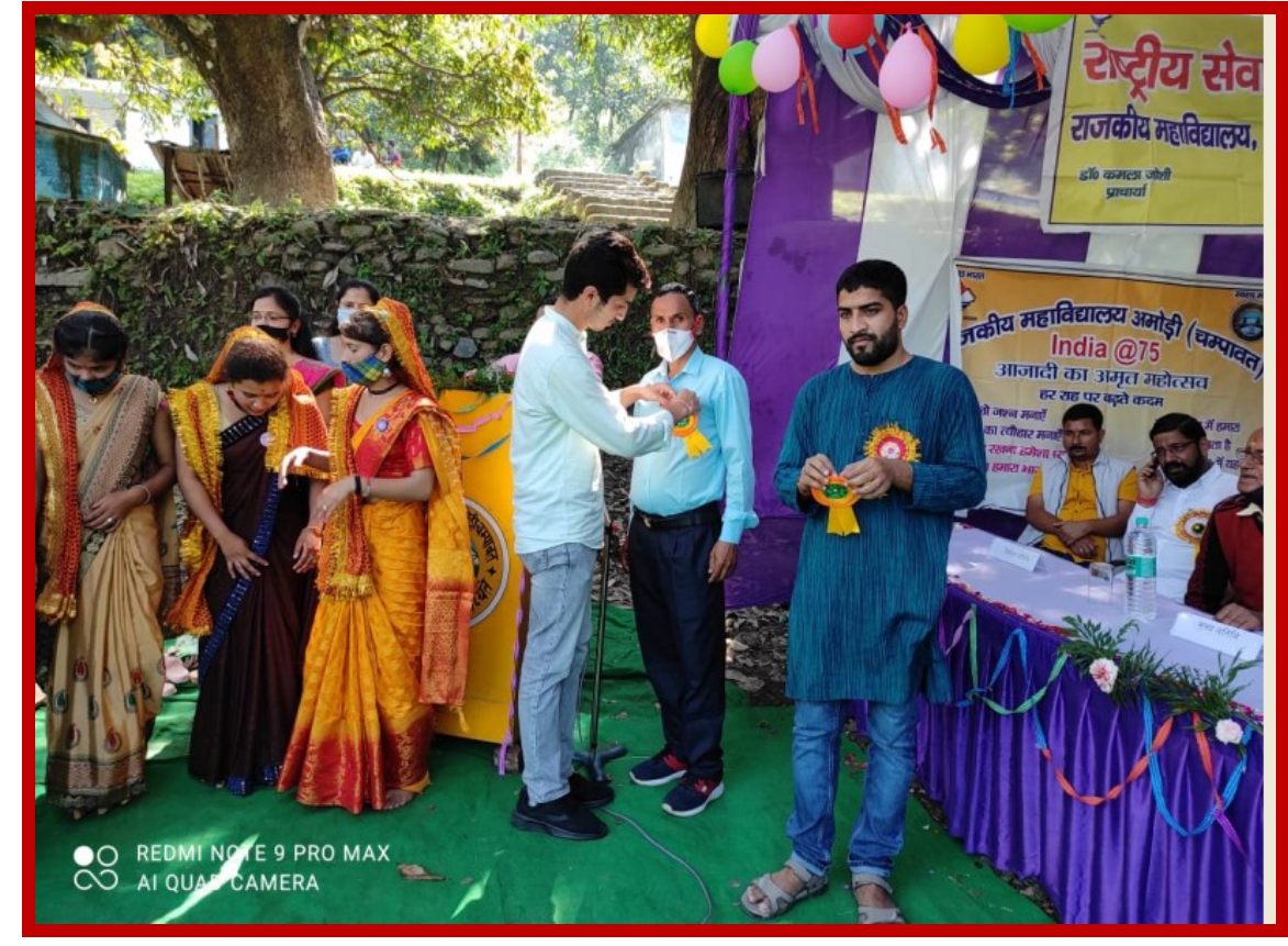
India@75 Azadi ka Amrit Mahotsava