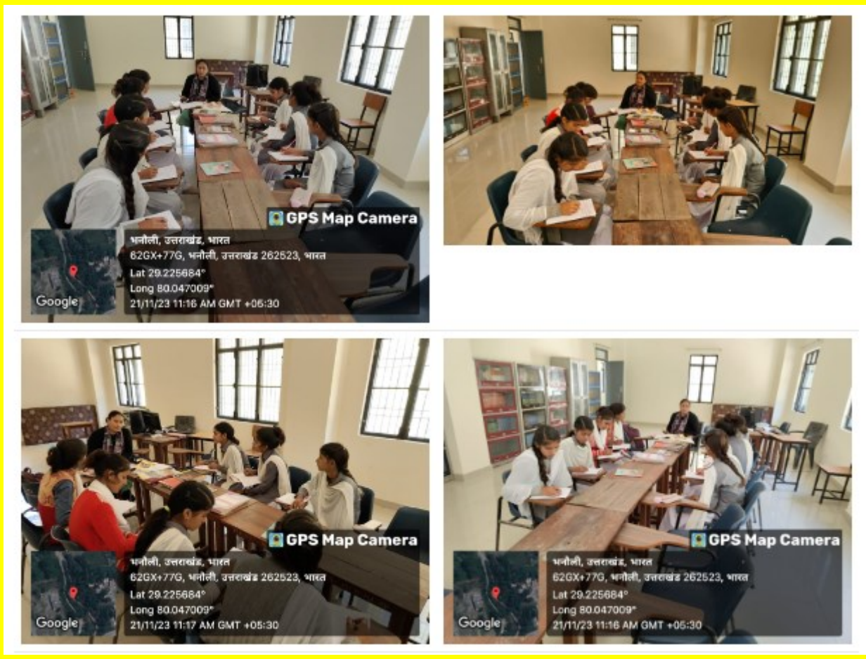
Students are in the Library & reading on that

Online classes and online e-content are also made available in the college. Besides, a large number of books have been made available in the library from where the students get support in their studies by getting the books.