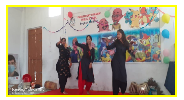
Promotional Activity at Paramount School of Amori