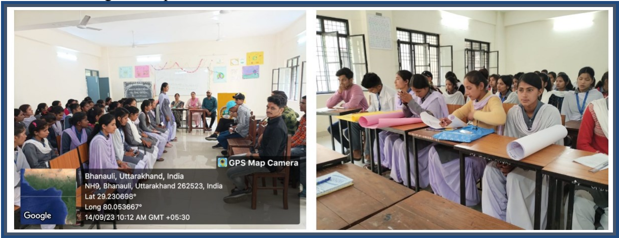
Teaching Learning in Class Room

The college is running in its building in which the learned professors of the college are trying to promote the knowledge related to their respective subjects, art, Sanskrit, Hindi knowledge-tradition etc. Educational activities are being conducted in the college by the New National Education Policy 2020. The College has recognized the vital role of infrastructure in providing a conducive environment for the teaching, learning and overall development of its students. In terms of classrooms and laboratories, the Institute has taken important steps to ensure the availability of adequate facilities. The college has its building, principal's room, office room, store room, adequate toilets, playground, 07 classrooms, conference room, lab, computer room, library, reading room, examination room, common room for boys and girls, adequate Books, CCTV cameras are available. The college also operates Uttarakhand Open University Centre, and Devbhoomi Entrepreneurship Centre. IQAC, Grievance Redressal, Anti-Ranging, Admission, Examination, Sports, IPR, NSS Rovers Rangers, Sweep, Career Counselling, Proctorial Board etc. are working in the college. The college has always kept its infrastructure in line with the vision and goals of the institution on priority. To promote technical skill knowledge, the college has also signed a MoU with two institutes, KITM Khatima and Government College Tanakpur.