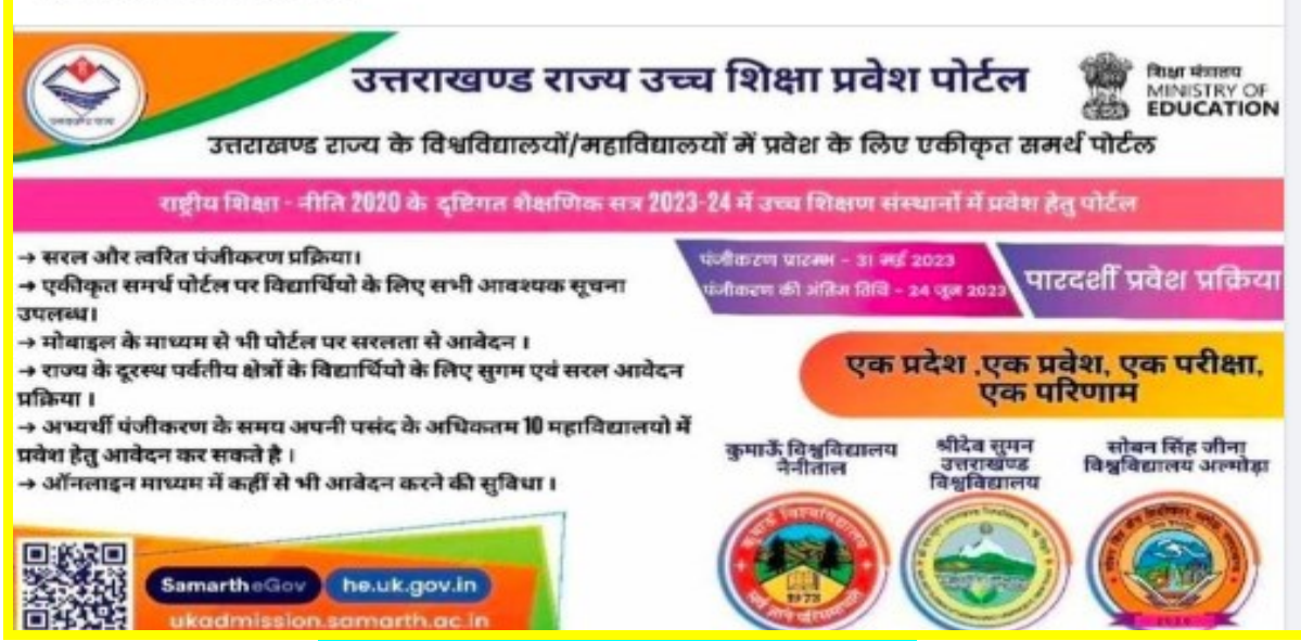
Promotional Activity on College Facebook