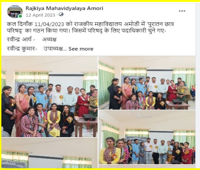
Promotional Activity on College Facebook

Along with the above in the college, various types of WhatsApp groups including Azadi Ka Amrit Mahotsav, Communication Skills, Alumni Association, etc. are operated, where various types of activities of the college like admission work, examination, scholarship, career counselling, and sports activity such as news and notice are sending accordingly. So that the programs of the college and its impact can be disseminated in the society. As a result of all the above-mentioned teaching-learning promotional activities, it is our endeavor that the college can be develop and established on the national stage.