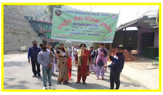
Former Principal on Promotional Activity