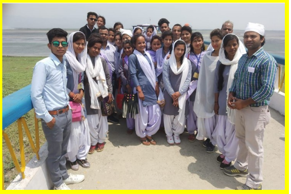
Educational Tours of the College