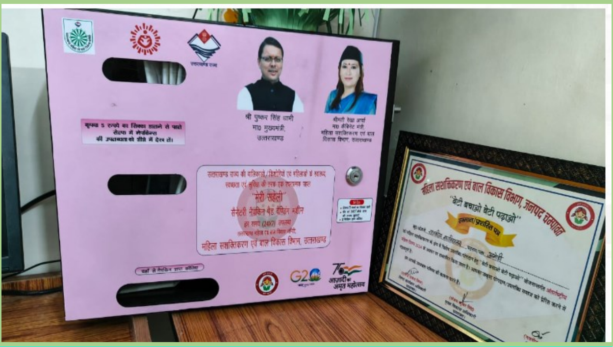
"Sanitary Napkin Vending Machine with Disposal Machine" provided by District Administration Champawat (Uttarakhand)

Per the New Education Policy 2020, a language lab has been established in the college in all the necessary facilities have been installed. In the context of the health and hygiene of girls' students, the college has installed one "Sanitary Napkin Vending Machine with Disposal Machine".