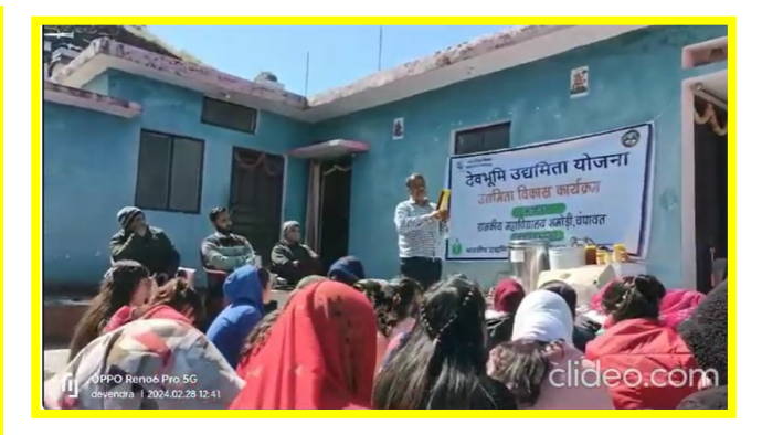
Promotional Activity https://youtu.be/zc1QgeK2AHg?si=tsXcwwiXUmAGny4E