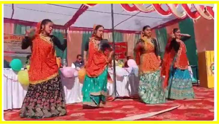
Promotional Activity on YouTube https://youtu.be/SZnfhoL7oNw?si=VhtUDxZitj-Hqc7b

To promote all the activities of the college in society, a YouTube channel and Facebook page of the college is also operated on which the activities of the college are uploaded.