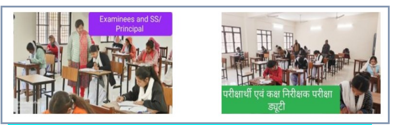
Examination hall of the college, Students are in the Examination room, Principal is on SS duty